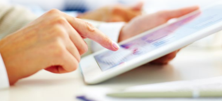
Hand and Wrist Pain