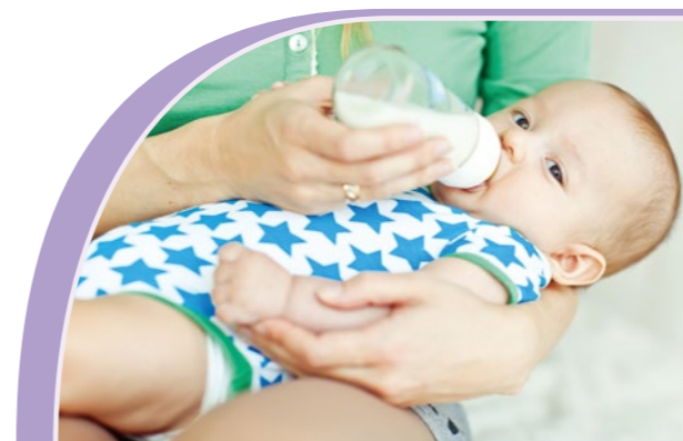
Hand and Wrist Pain

徵狀： 痛楚一般見於手腕旁邊近拇指的位置，可上延至前臂。當大力握物或轉動手腕（如扭開罐子）時，拇指一邊的手腕則感到痛楚。