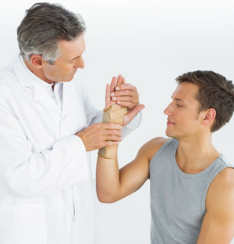
Hand and Wrist Pain